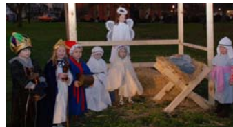
Genoa Christian Academy's live nativity!