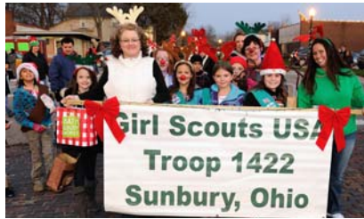
Local Girl Scouts join in the fun!