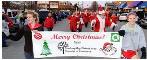
The Chamber wishes everyone a very Merry Christmas!