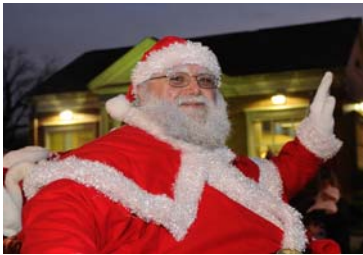
Ho Ho Ho Santa!