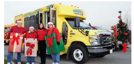
Our friends from DATABus!