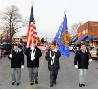
American Legion color guard leads the parade!