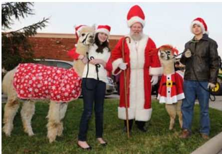
St. Nicolas poses with the Alpacas